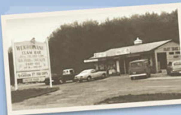
Photo of the original Weathervane Take-Out, taken in 1970. Today, Weathervane Seafood Restaurants are now conveniently located throughout New England. For a list of locations or more information, please visit www.weathervaneseafoods.com

KIDS EAT FOR $1.99 EVERY WEDNESDAY! When They Order From Our Mini-Martini Menu—Dine In Only