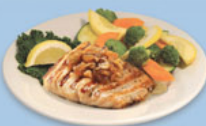
Grilled Maple Salmon with MacIntosh Apple Drizzle served with Fresh Steamed Garden Veggies

Several Weathervane entrées & appetizers are listed on HealthyDiningFinder.com